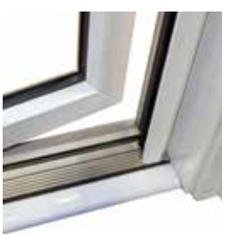
Low threshold option